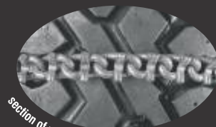
section of v-bar ladder chains