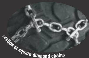
section of square diamond chains